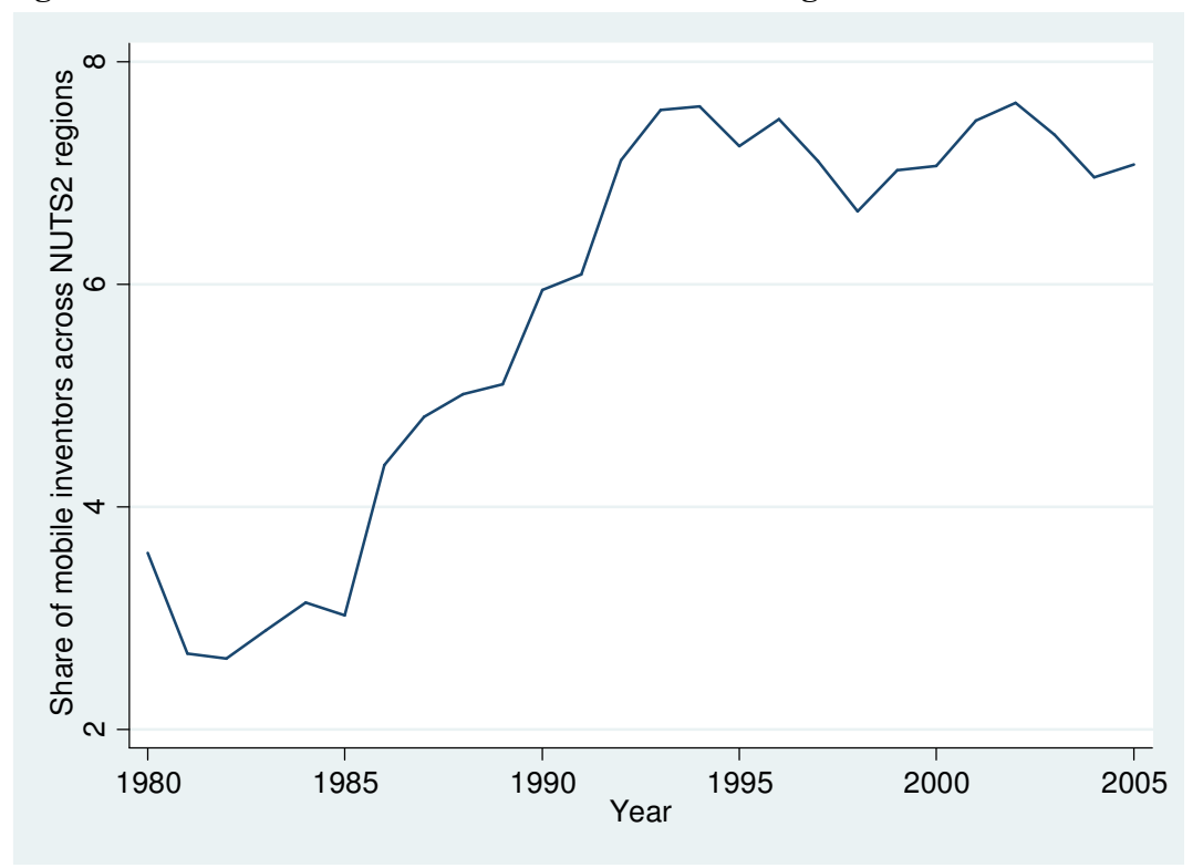
Figure 2. Share of mobile inventors across NUTS2 regions